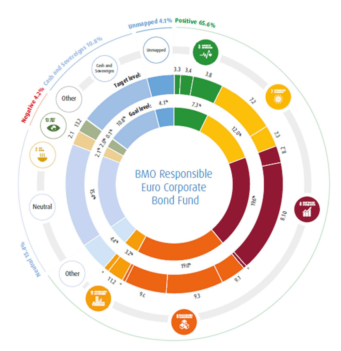
Illustration: Breakdown of Portfolio by contribution to UN SDGs